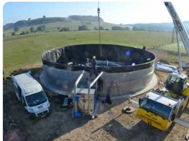
Day 3: Inner lining of the digester