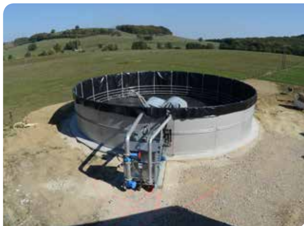
Day 4: Digester walls assembled