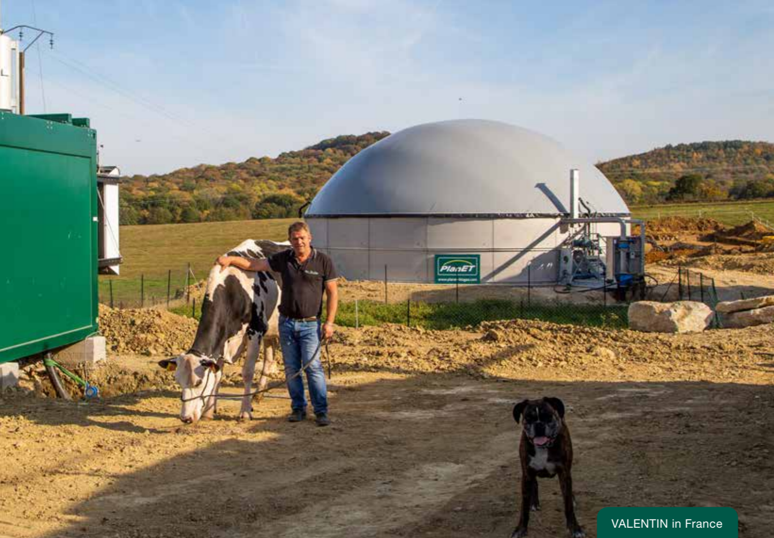
VALENTIN in France