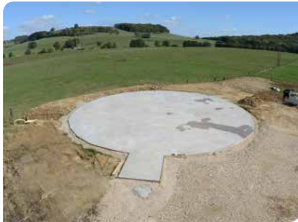
Day 1: Prefabricated slab by the client