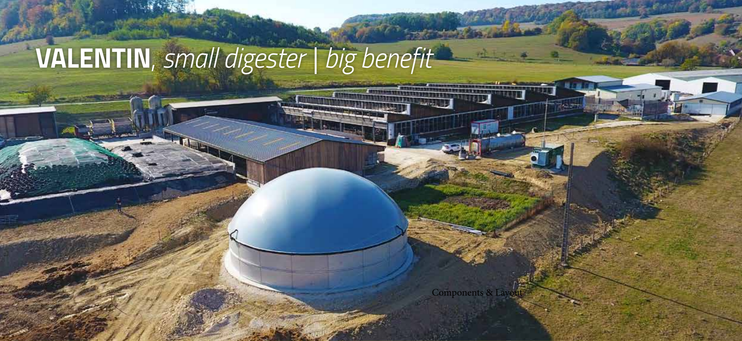
Components & Layout