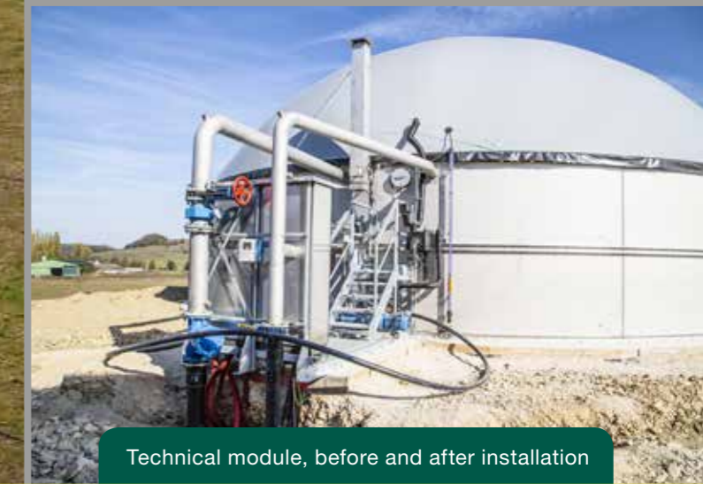
Technical module, before and after installation