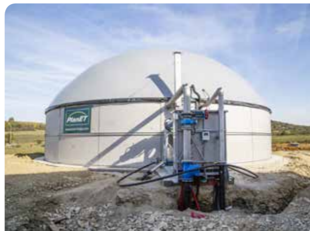
Day 10: Installation and commissioning of the membrane roof with gas storage. Gas and minor supply lines connected.