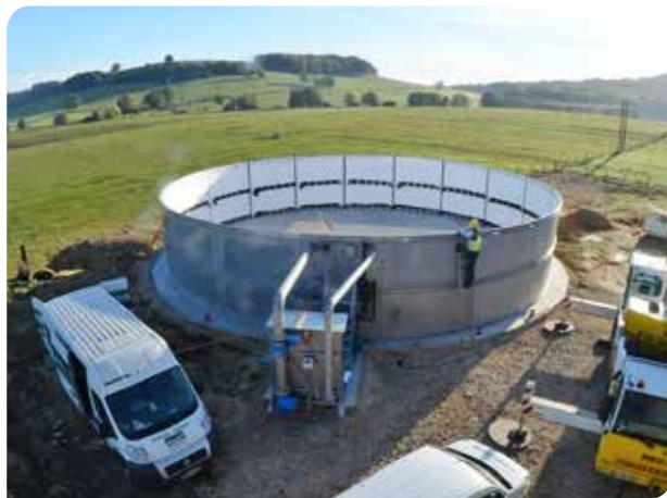
8:00 pm: Wall panels are assembled