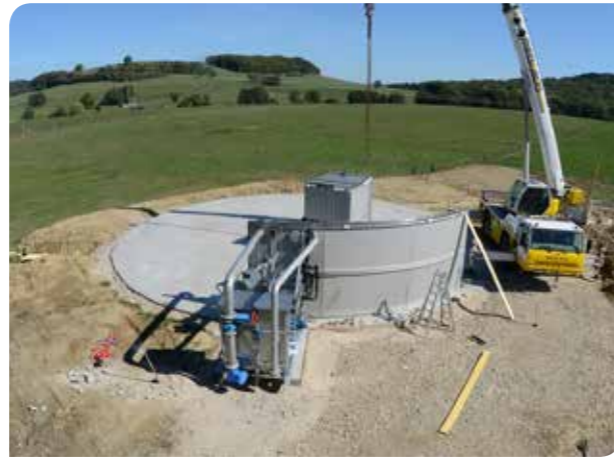
12:00 pm: Position of the technical module and first wall panels