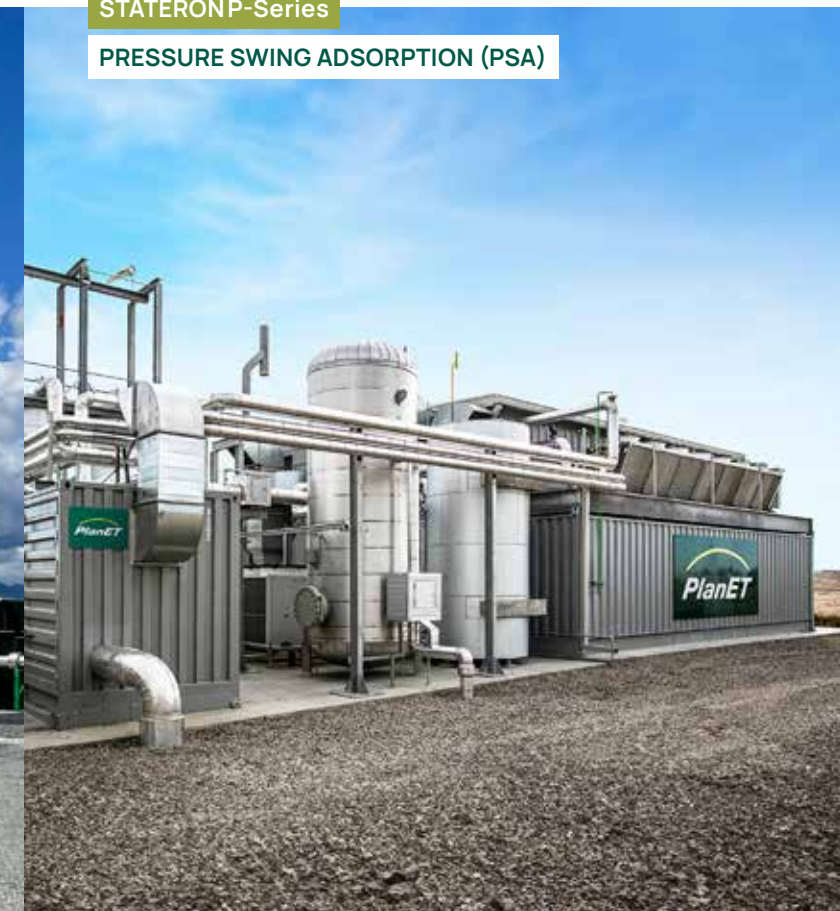
PRESSURE SWING ADSORPTION (PSA)