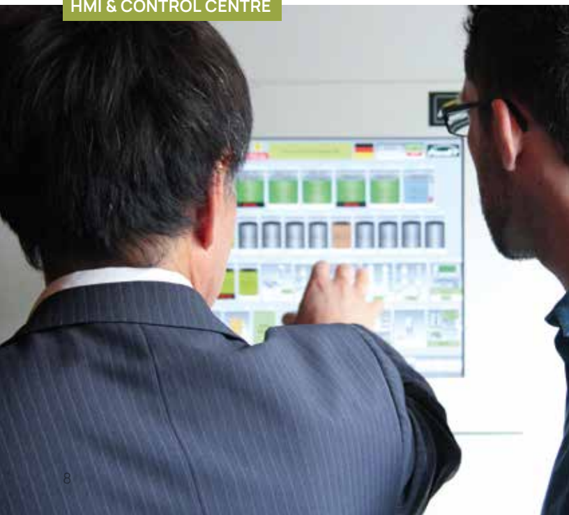
HMI & CONTROL CENTRE