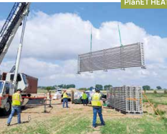
PlanET HEATING RACKS

Another option is the top-mounted Central Agitator, consisting of a rotating shaft with blades or paddles that agitate the substrate inside the digester. The agitation helps with uniform mixing, preventing solids build-up and handling higher total solids (TS) while optimizing both capital (CAPEX) and operational (OPEX) costs.